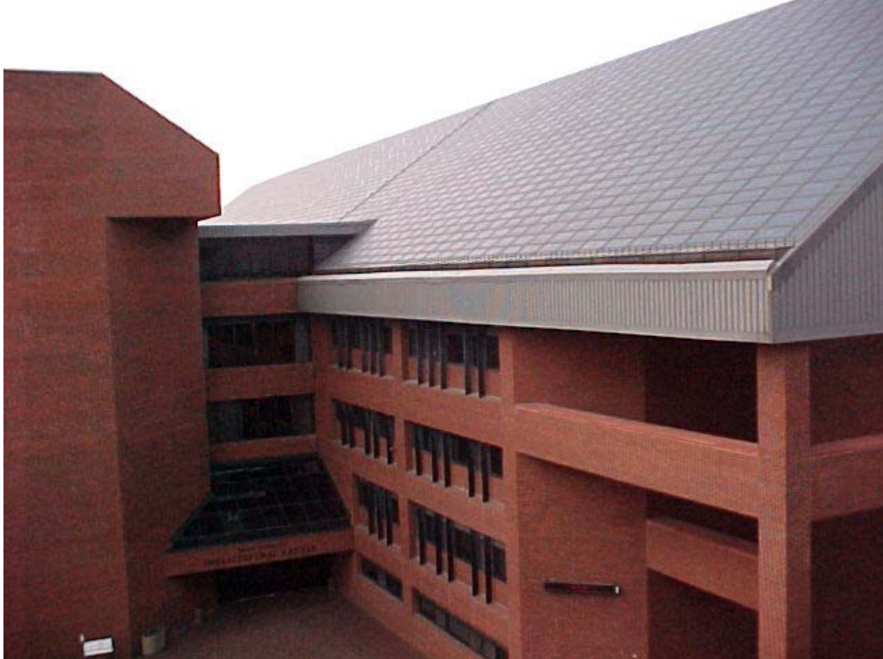
30,000 SF Building-Integrated Photovoltaics [BI-PV] Rooftop Generates 1 MWh Daily Since 1984 Georgetown University Intercultural Center Washington, DC